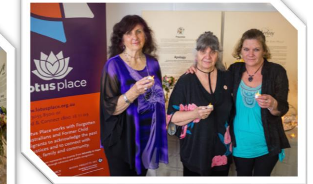
This year Remembrance Day was also held at the Gold Coast