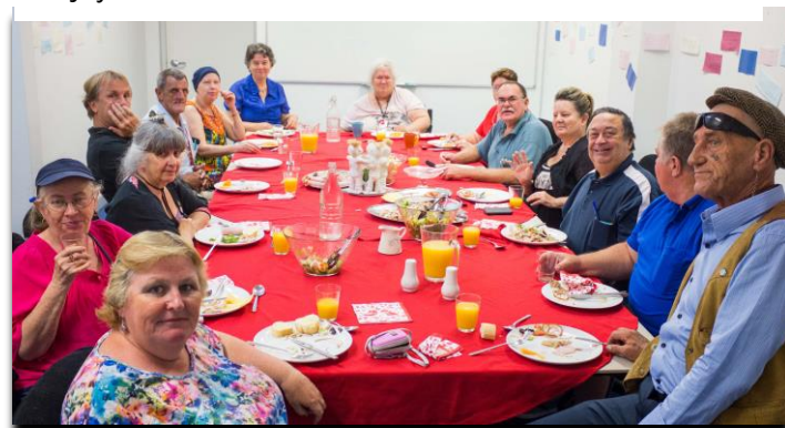
Tuffnel Reunion at Lotus Place