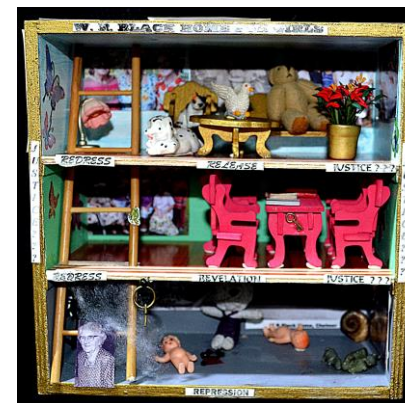
'What is Justice?' Exhibition Box by Olga

This exhibition that was on at Queensland Museum South Bank from the 9 th of August to the 14 th of November 2014. During this time thousands of visitors from across the globe saw the exhibition. Many of the people were moved to leave heartfelt comments about what they saw and how they felt about it. Some of these cards have been on display at Lotus Place since 19 th November. Here are a small selection.